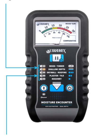
Scales 3, 4 and 5 have a preset sensitivity appropriate to the density of the materials indicated.

Scales 1 and 2, when used with wood, will give a %MC reading.