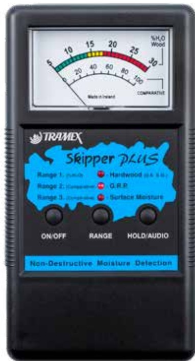
Product Code : SMP

Osmosis, also known as Gelcoat Blistering, is found in GRP hulls when moisture soaks into the hull surface, collects between the glassfibre and plastic laminate, resulting in blistering of the gelcoat. Usually found on or below the waterline, Osmosis dramatically reduces the structural strength of the hull and the value of a boat.