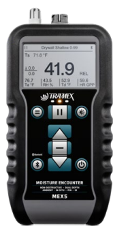
Product code: MEX5