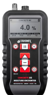
Product code: CMEX5

The probes can be used with the CMEX5, MEX5 and Feedback Datalogger RHTX for relative humidity testing in building structures and ambient conditions.