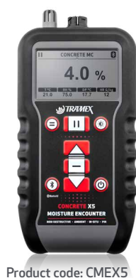
Product code: CMEX5

The Hygro-i2 ® probe is used with the CMEX5, Feedback DataLogger DL-RHTX, CMEX II or the MRH III for relative humidity testing of flooring slabs and ambient conditions. The Hygro-i2 ® probe is used to carry out in situ RH tests (ASTM F2170) and hood RH tests (British Standards 8201, 8203).