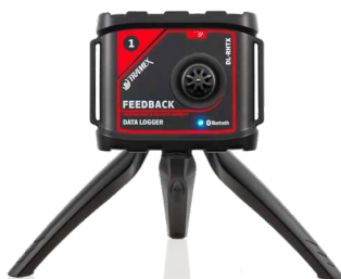
Product code: DL-RHTX