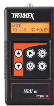
Product code: MRHIII