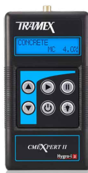
Product code: CMEX2