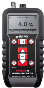
Product code: CMEX5

The Hygro-i2 ® probe is used with the CMEX5, MEX5 and Feedback DataLogger DL-RHTX for relative humidity testing of flooring slabs and ambient conditions. The Hygro-i2 ® probe is used to carry out in situ RH tests (ASTM F2170) and hood RH tests (British Standards 8201, 8203).