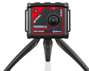
Product code: DL-RHTX