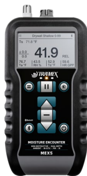
Product code: MEX5