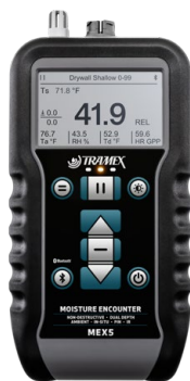
Product code: MEX5