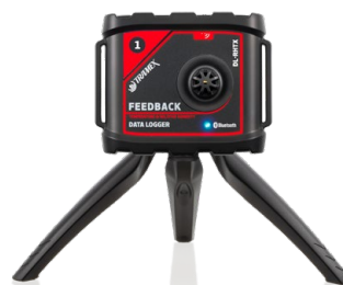
Product code: DL-RHTX