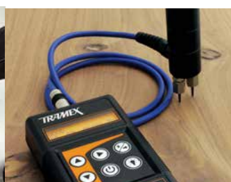
ASTM F2170 & BS 8201:2011