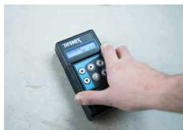
FMK5.2-EU 08/18 REV.1.1